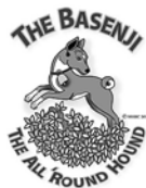
Mid-Atlantic Basenji Club of Maryland